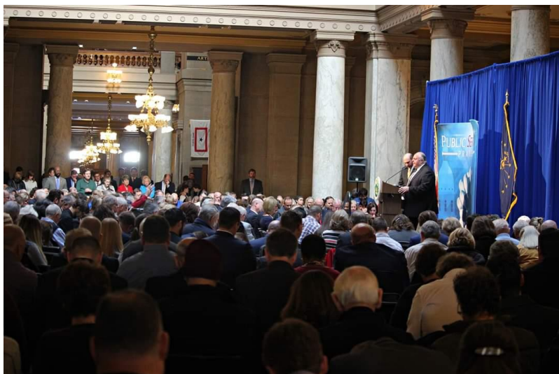
2019 Statehouse Prayer Service

For the first nine years I was not authorized to be on the House and Senate floor with the legislators. As the ministry expanded, I was able to teach Bible studies and develop relationships with legislators in the halls, but during the actual sessions I spent a lot of time in the public galleries of the House and Senate. I am thankful for those years because I learned the intricacies of legislative protocol and procedure. I also had the opportunity to meet with and minister to the many lobbyists that sit there. I became well versed in how to pray effectively for the activities on the floor of the House and Senate as well. To be honest, those were lonely and challenging years, but they caused me to rely more fully on the Lord's direction. I remember asking the Lord throughout each day which direction He wanted me to go, where He wanted me to sit, whom He wanted me to talk to. Constantly meeting new people was extremely difficult for an introvert like me! But God used my weakness for His glory and continued to open doors of ministry.