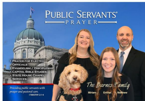
First and most recent prayer cards