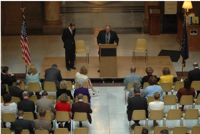
First Statehouse Prayer Service, 2005

We decided at the outset that we would focus on the most important thing - the gospel - and stay out of politics. After all, we reasoned, what good is it twisting the arm of a leader to vote a certain way, and neglecting to tell them about the life changing gospel of Jesus? This was reinforced to me at the beginning of the ministry when I had the opportunity to lead a legislator to the Lord and then he died soon afterwards. Over the years, we have been reminded time and again that when we show Christ's love to leaders and point their hearts to the gospel, He changes everything. We have seen legislators come to know the Lord or deepen their walk with Him, and the Holy Spirit does a work that lobbying can never do. All glory to God!