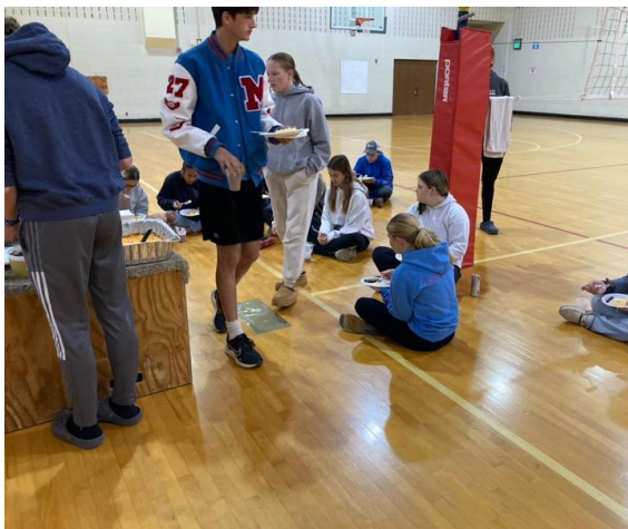
Northwestern HS FCA